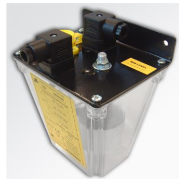
Single-line Piccola (01)

The pump supplies the lubricant in a continuous manner, but where appropriate, it can be equipped with an appropriate timer kit that allows for the distribution of oil at regular time intervals according to the requirements of the machine at hand.